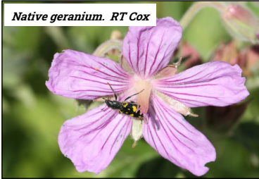
Native geranium. RT Cox

Management efforts for the later half of this season included both chemical and mechanical treatments. In addition to general day to day work, CVA hosted three spray days in our Wildlife Habitat Improvement Program (WHIP) areas, hosted a weed week in August, where crews cover the entire valley floor, and a final weed week in September, where the field crew focused on treating Canada and musk thistle patches. Priority invasive weed species that we focused heavily on were spotted knapweed, houndstongue, whitetop, hoary alyssum, Canada thistle, and common mullein. In total, the TNCVA field crew monitored and treated about 170-acres!