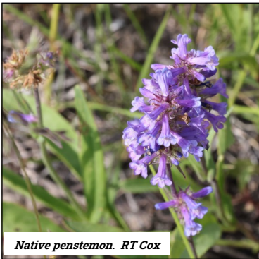
Native penstemon. RT Cox

Finally, the CVA and TNC crews assisted the Beaverhead-Deerlodge National Forest's Madison Ranger District conduct Early Detection, Rapid Response (EDRR) weed management to prevent weed species from spreading into bareground soils within the burn, as well as on equipment lines and routes to the fire. Thankfully, the crew did not discover too many patches of invasive weeds! Canada thistle was the primary offender, with some spotted knapweed and hoary alyssum identified. The area was traversed using UTVs, ATV, and by truck, and nearly 5-acres of invasive weeds were treated, and many more acres monitored!